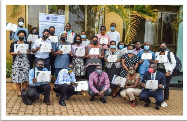
Photo: Participants display certificates of completion after one of the completed capacity building sessions.