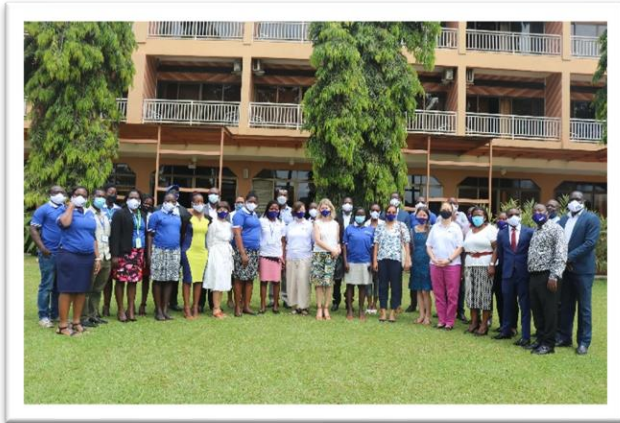
Photo: End of Project Workshop Group Photo at Hotel Africana 8th December 2021 (in the Middle is the GoH – Swedish Ambassador)